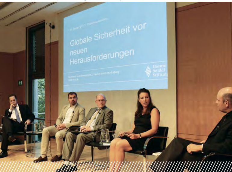
Discussion on global security in Munich

The Hanns Seidel Foundation Academy differs from other political research institutions in a number of ways, including the fact that issues are addressed by experts from different fields. An interdisciplinary approach is a prerequisite for adequately unravelling the complexity of national societies and the international political and economic system.