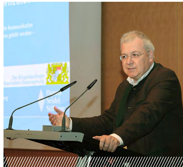
Chairman Markus Ferber, MEP opens a conference for more and better communication with citizens

The Hanns Seidel Foundation Academy differs from other political research institutions in a number of ways, including the fact that issues are addressed by experts from different fields. An interdisciplinary approach is a prerequisite for adequately unravelling the complexity of national societies and the international political and economic system.