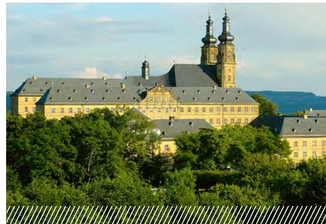
Kloster Banz Educational Centre (former monastery)