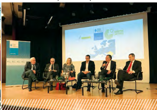
German-Greek Symposium in Athens on security and stability in the Balkans