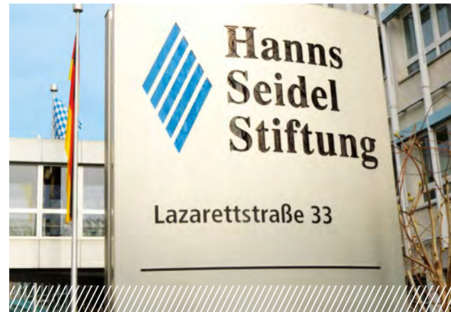
Foundation Headquarters, Munich