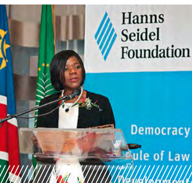
South African Ombudswoman Thulisile Madonsela