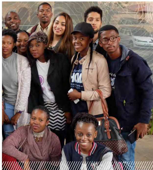
Civics Academy Youth Dialogue participants at the Nelson Mandela Foundation in South Africa