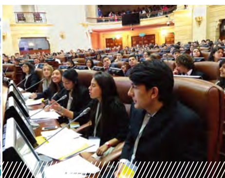
Insight into the work of the parliament in Colombia