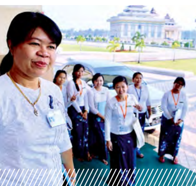
Supporting a more people-oriented parliament in Myanmar – A visitor service has been developed