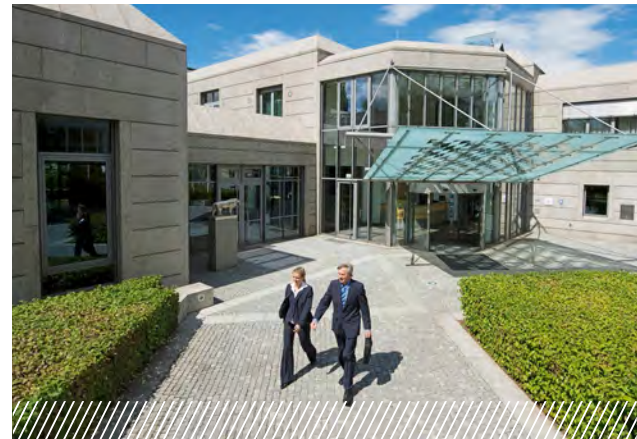
Munich Conference Centre