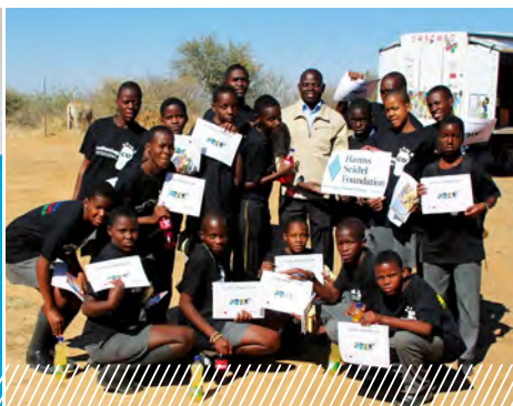
Participants at a conference on renewable energy in Namibia