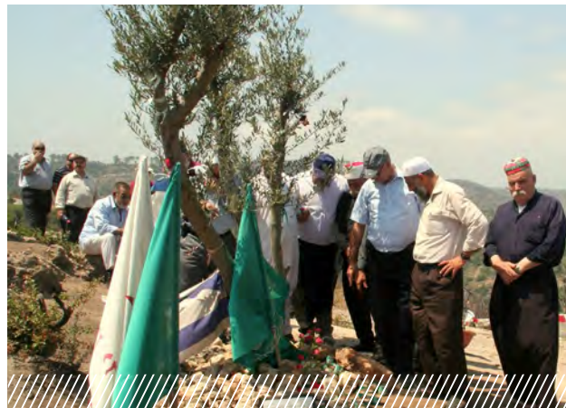
Promotion of ecological sustainability and environmental awareness

The European Office in Brussels manages the development policy dialogue with the responsible European Union contacts. European development cooperation is discussed in dialogue forums and specialist conferences. These events form a platform to point out approaches for cooperation and thus help shape European policy. A key factor here is sustainable networking of our project partners with EU experts. We continue the dialogue with the public and decision-makers in politics and science in Munich through the publication series of "Arguments and materials of development cooperation" and "Development Policy Forum" events.