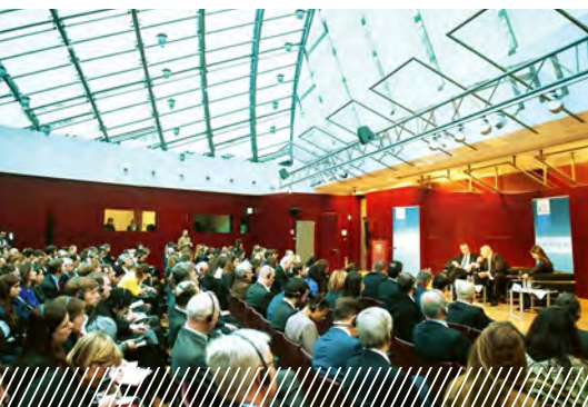
Panel discussion in Brussels on the role of the Balkans