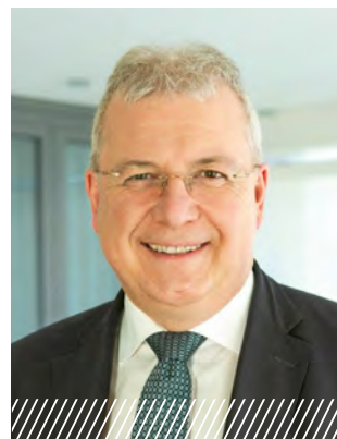
Markus Ferber, MEP Chairman

Mission and objectives must be pursued consistently. Structures must be reviewed, processes corrected, and new formats developed and introduced. Digitalisation is also becoming increasingly important for political education. We are very well positioned here. Online seminars are no substitute for face-to-face seminars, but they complement our range of services decisively. This enables us to generate new reach to young target groups. Participation in the socio-political debate, dialogue with various interest groups, and the development of solution strategies are among our tasks – which we fulfil nationally and internationally, always in the service of democracy, peace, and development. This brochure provides a compact overview of the Hanns Seidel Foundation’s wide-ranging activities.