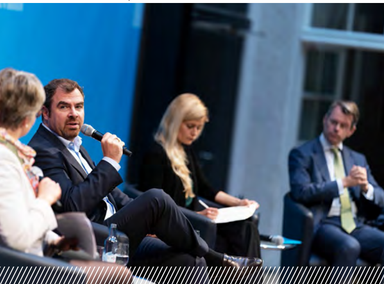
With a panel discussion on European sovereignty at the Bavarian Representation in Berlin