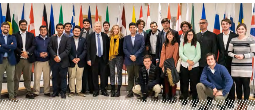
Delegation from Chile on "The EU institutions and current developments in the EU" visiting Brussels